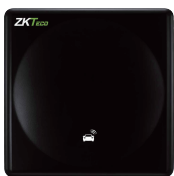
UHF 6Pro Series